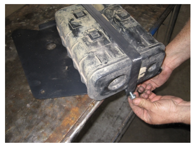
On the opposite end, bolt the two pieces together using the 3/8x 1" bolts, nuts, and flat washers.