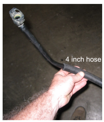
Cut hose as shown to approx length.