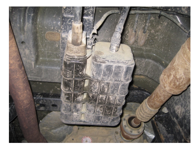
Exposed Evaporative fuel cannister.