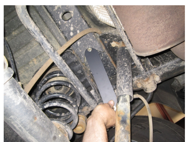
Insert the flat bracket into the frame channel as shown. Make sure the nut-serts are in the "Face-Up" position.