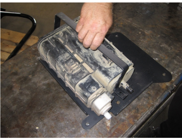
Place cannister on the new PJ skid plate and align bracket with bolt holes.