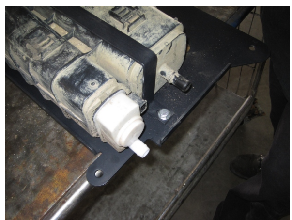
Bolt the two pieces together using the 3/8x 1" bolts, nuts, and flat washers.