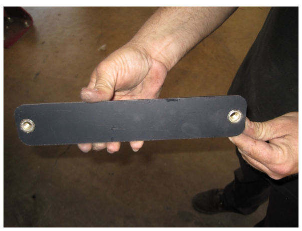
This flat bracket uses two 3/8" dia nut-serts as shown.