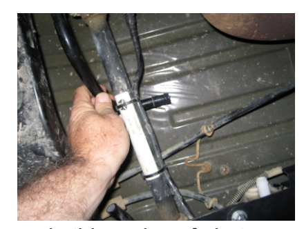
Rotate and route the factory hose over the cross-brace as shown in this series of photos.