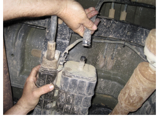
Remove all connections leading to the cannister as shown.