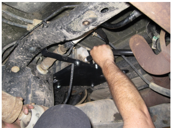
Install other rubber hose.