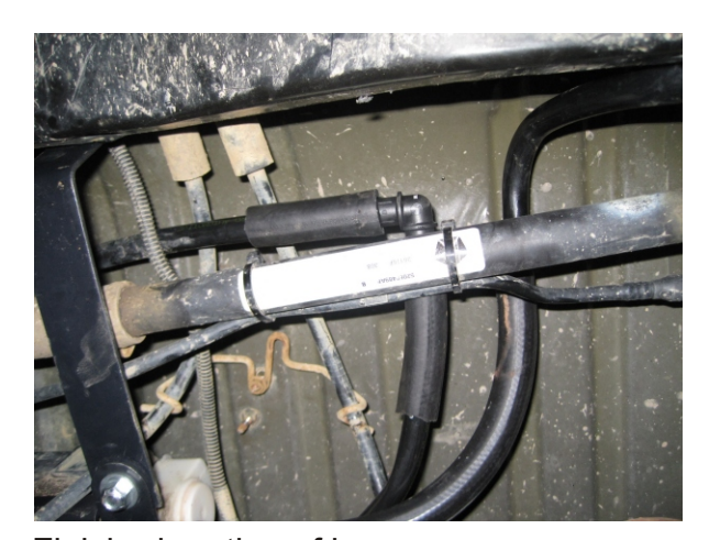
Finished routing of hoses.