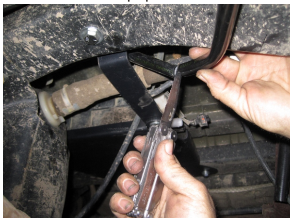
Cut factory hose just after the bend as shown. Save the cut end to be re-used.