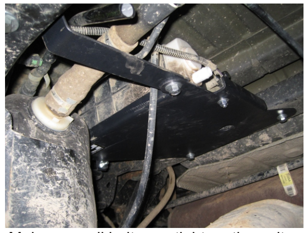
Make sure all bolts are tight on the unit.