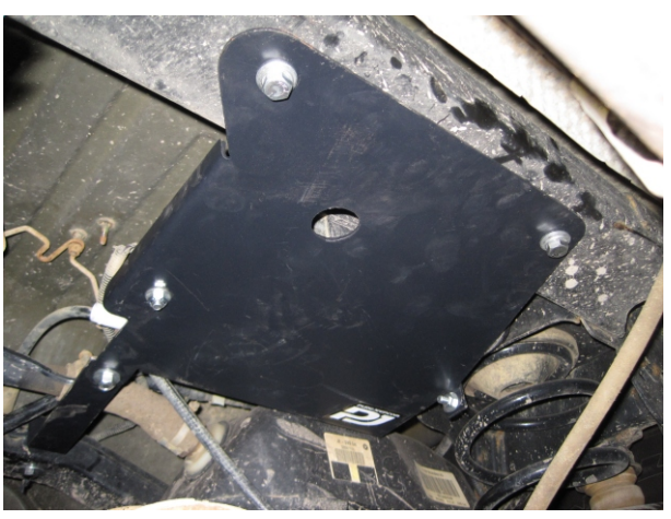
Mount the plate & cannister into position.