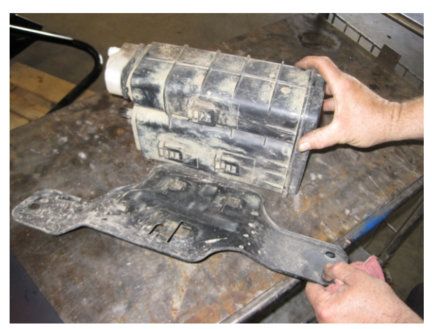
Separate the cannister from the base plate