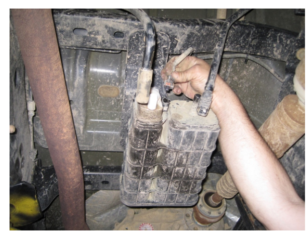
Removing electrical connection wire.