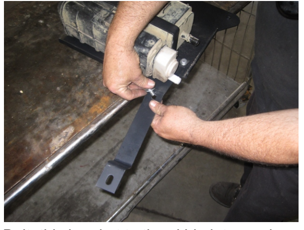
Bolt this bracket to the skid plate as shown using the 3/8x 1" bolts, nuts, and flat washers.