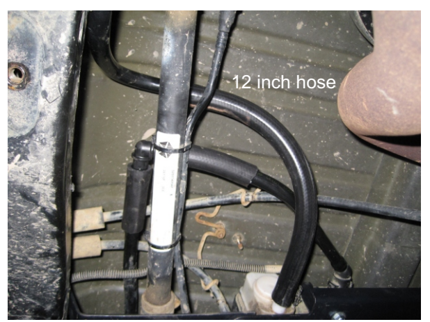
Finished routing of hoses.