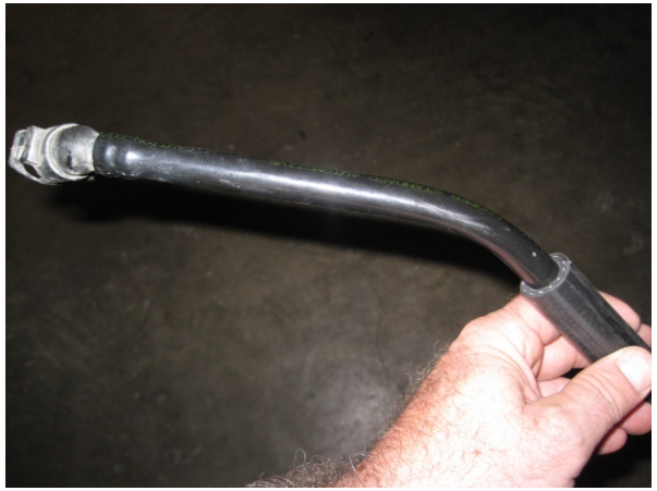
Mount new rubber hose to the cut end of the factory hose.