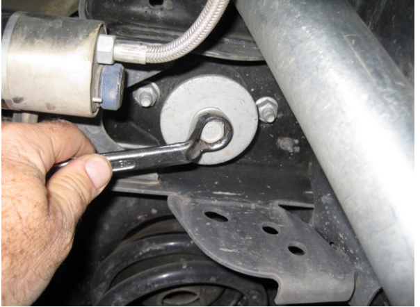
On 4-Door Models only: Remove the factory body mount bolt as shown. This will allow access of the flat bracket to go inside the cross-brace. The 2-Door model does not have this body mount bolt at this location.