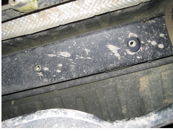
Align Nut-serts with holes in cross-brace. Reinstall the body mount bolt on 4-Door.