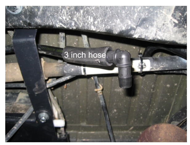
Insert plastic elbow into cut factory tube.