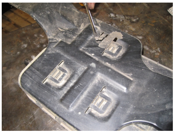
Use a Slotted Screwdriver to pry up the tabs of the factory base plate.